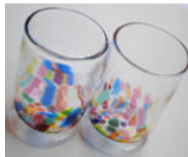
Confetti Tumblers by Will Shakspeare