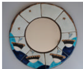
Mirror with Ceramic Boat Surround

frost proof so you can confidently leave them outside for people to find when they're having a nose around.