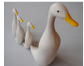
Pottery Ducks by Orchard Pottery

frost proof so you can confidently leave them outside for people to find when they're having a nose around.