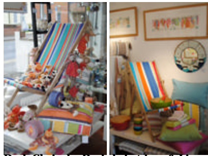
Deck Chairs by Deckchairstripes & Linum Linens